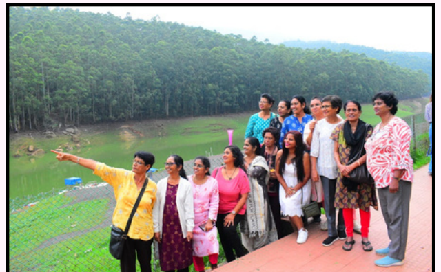
Exploring the natural beauty of Munnar town