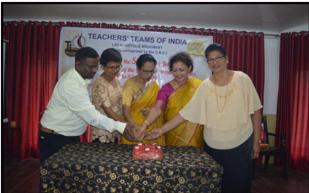
Golden Jubilee of the National seminar being celebrated