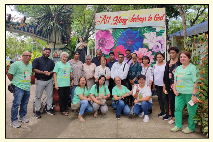
Visit to the Prayer garden with the Fillipino Teachers' Team members