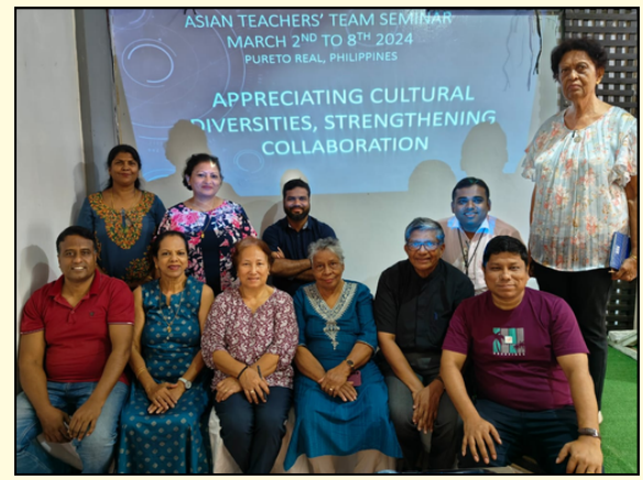
India and Bangalesh Teachers Team members